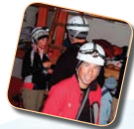
(Above) Preparing for the climb.